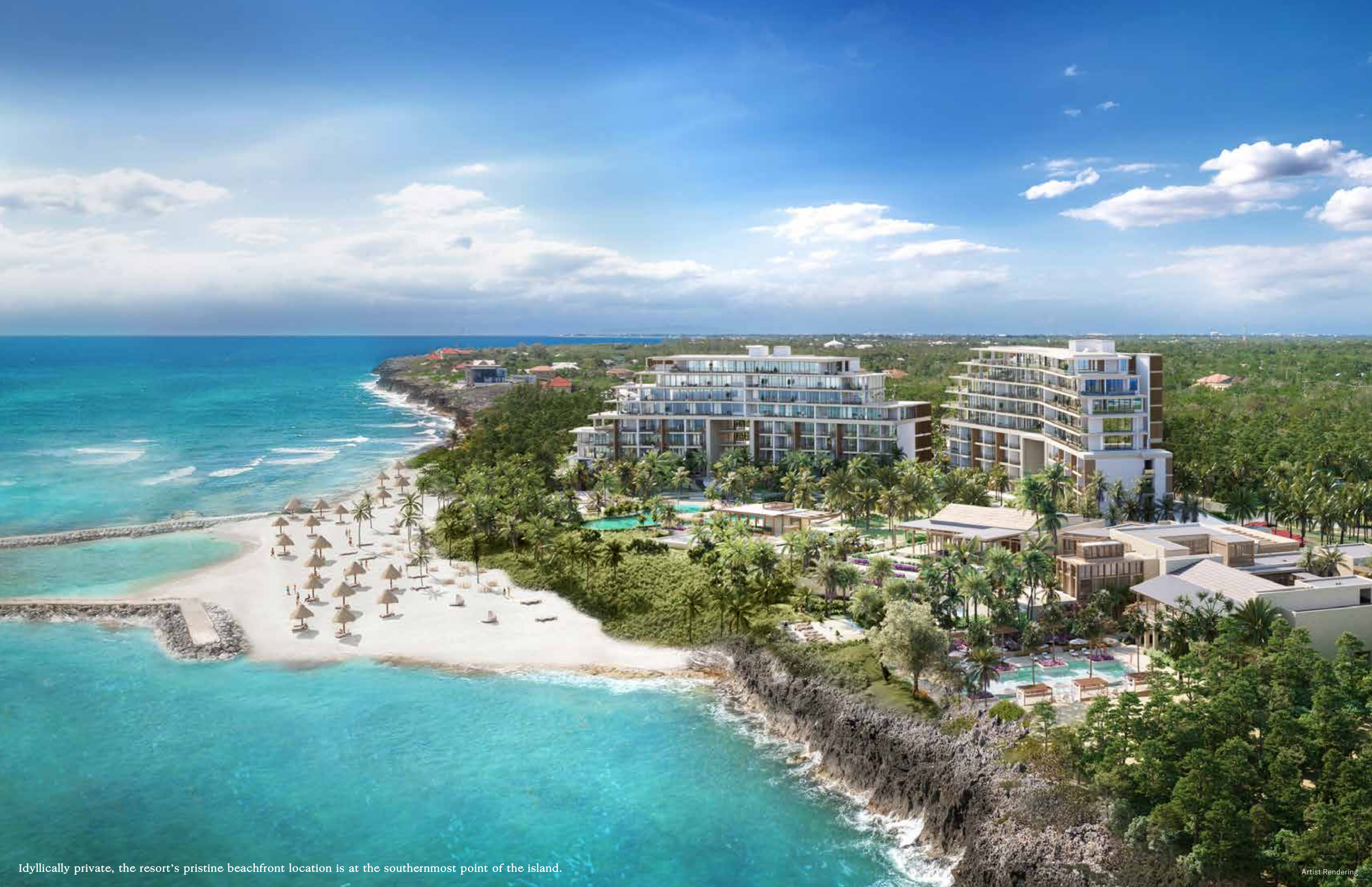
Idyllically private, the resort's pristine beachfront location is at the southernmost point of the island.