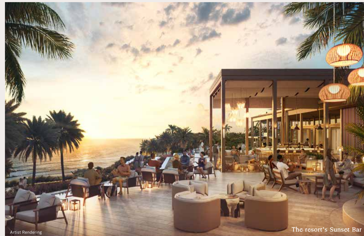
The resort's Sunset Bar