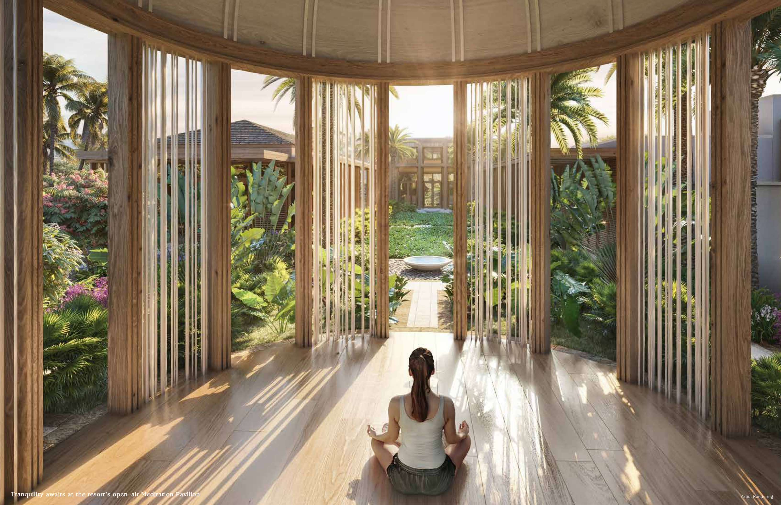
Tranquility awaits at the resort's open-air Meditation Pavilion