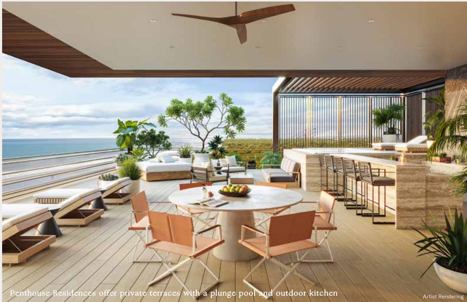
Penthouse Residences offer private terraces with a plunge pool and outdoor kitchen