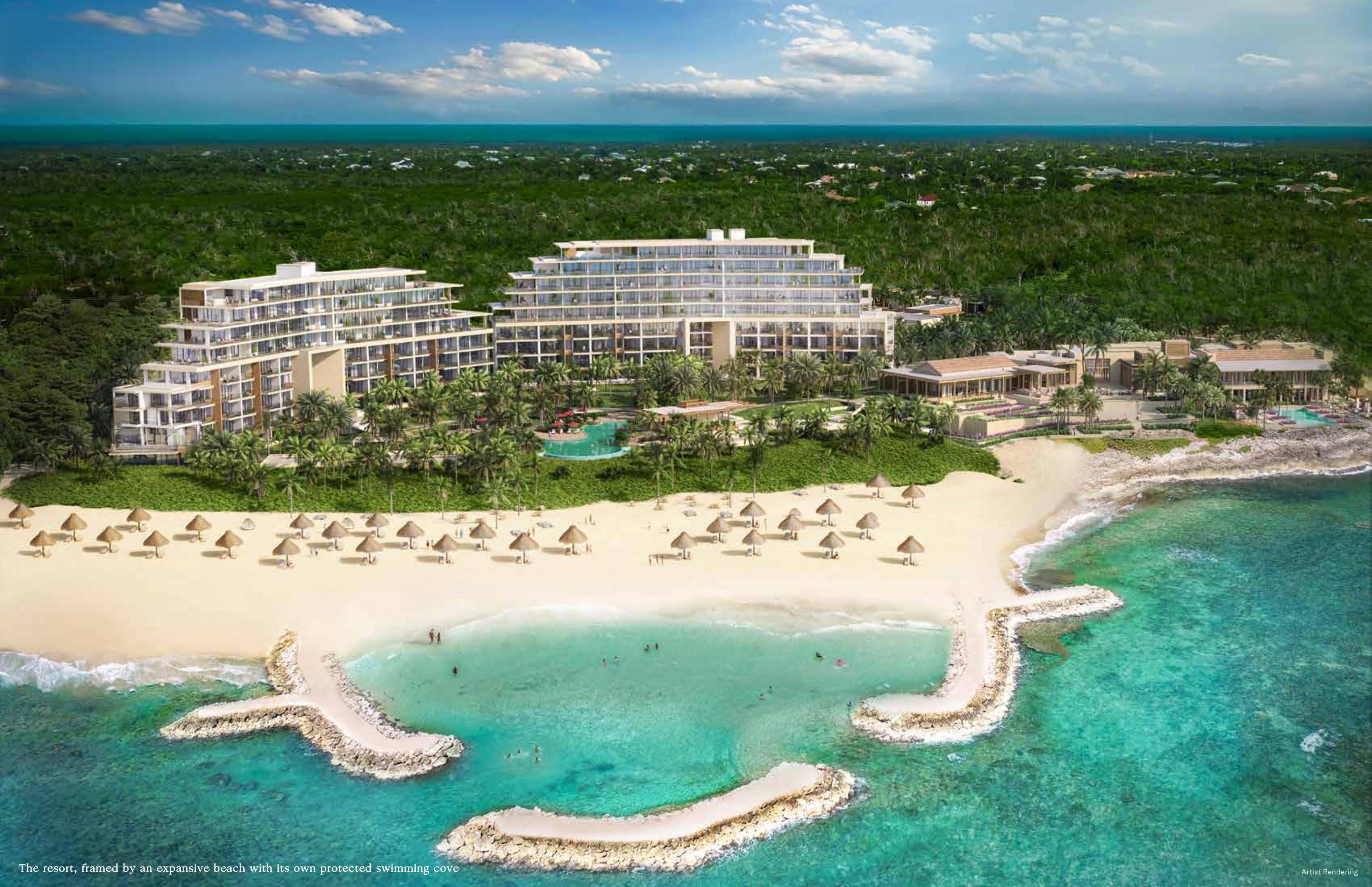
The resort, framed by an expansive beach with its own protected swimming cove